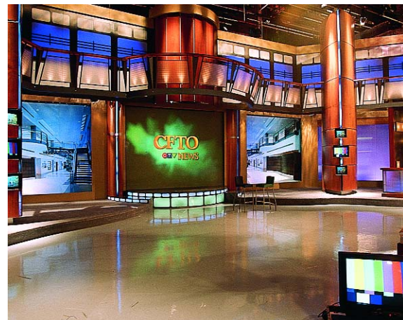
CFTO News - Canada