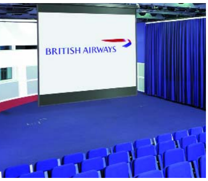
British Airways, Waterside Project - U