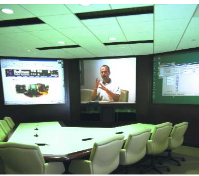
Wellpoint Boardroom - N.A.