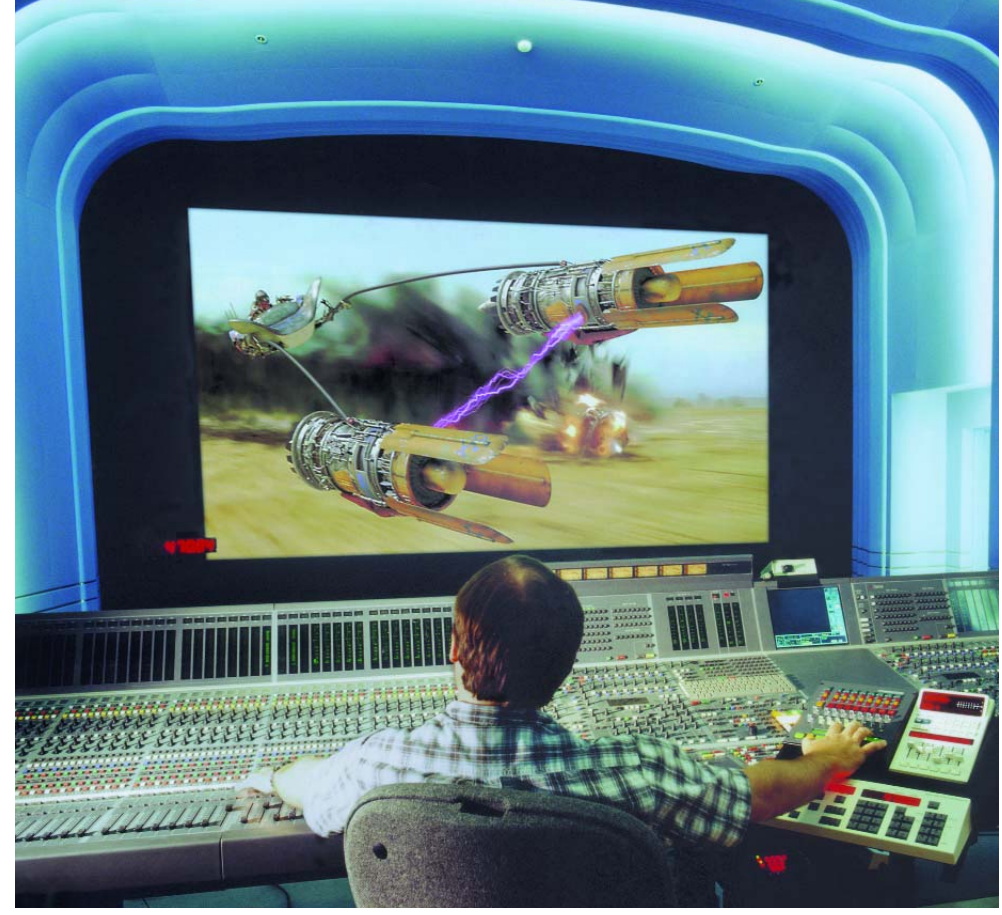
"The Phantom Menace", Lucasfilm - USA

We would never offer our clients image without substance and the Vista X3 is brimming with features that make for both simple and complete control of your presentations. Furthermore the Vista X3 offers reliability and serviceability second to none. So the Vista X3 makes your images look great, but makes you look even better.