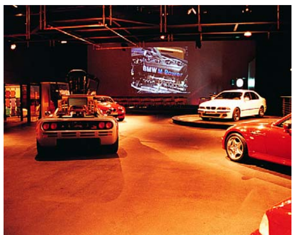
BMW Motorsport, M Studio - Germany