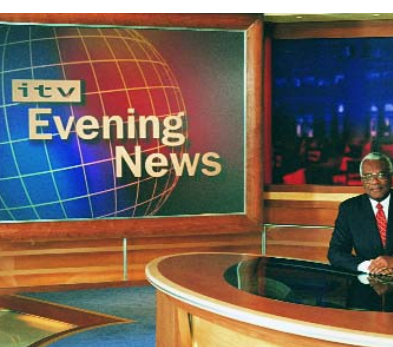
ITV Evening News -

If image is everything to you, then the new Vista X3 has everything you need. More than 1 billion displayable colors can be re-created to project the most resplendent and striking visuals, courtesy of the very latest in 3-chip DLP<sup>TM</sup> technology.