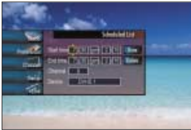
Advanced Record Set-Up Screen