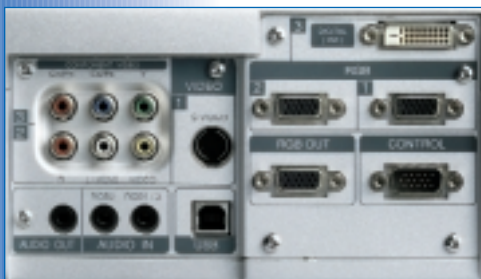
Connectivity: 3 RGB inputs / 3 video terminals