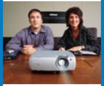
Reduce your preparation time and project in an instant.