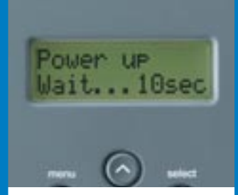
ProjectAbility = ease.