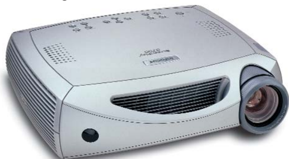
InFocus® ScreenPlay™ 5700