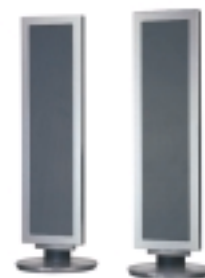
Optional Speakers with Desk Stands

RS-232C Control: 9 Pin D-Sub Connector (Male)