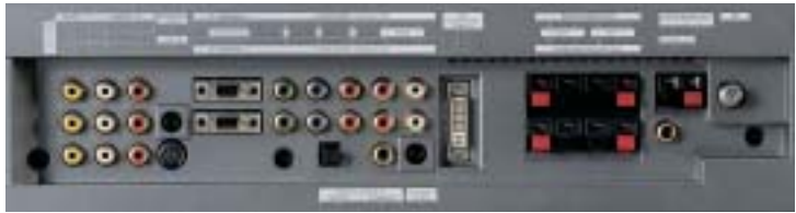
Rear Jack Panel