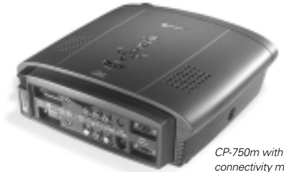
CP-750m with optional connectivity module