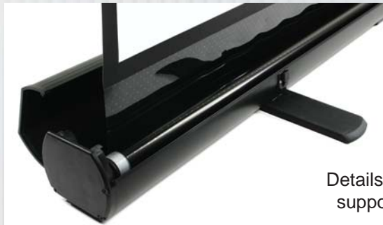
Details of the telescope bracket hook support and variable height setting

ezCinema Series , Screens pull up from case and attach to an adjustable telescoping bar with variable height settings with a keystone adjustor. Solid rotating floor supports provide added stability.