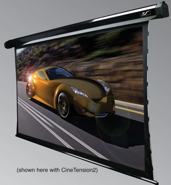
(shown here with CineTension2)

Elite's AcousticPro1080™ material is designed for use with a native 1080P front projector. It has a special fabric weave for acoustic transparency that greatly reduces light penetration. It is a 1.0 Gain matte white mesh material with outstanding sound quality, damping at 20 KHz only 2.0dB and Max. Attenuation at 20cm is around 1.1db. The side-weave mesh pattern has only a 8% light loss, and coated fabric provides true color rendition to ensure both audio and video quality with each presentation. The Elite AcousticPro1080 Woven Acoustically Transparent Screen is your best choice for use with high quality in-wall audio installations and 1080P projectors and has a detachable black-backing on its fixed frame models.