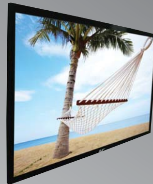
(shown here with ezFrame)