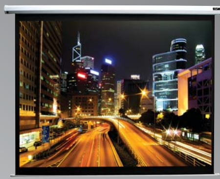
(shown here with Spectrum)